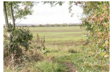
Figure 2: Footpath Tetney Lane to 8 Acre

Footpaths, cycle ways and bridleways are key conduits enabling the linking of publicly accessible green spaces in and around the village. New routes should be considered with any new development linking existing and new features as well as joining with routes to the wider countryside. Existing public footpaths and potential new routes can be seen in Map 1.