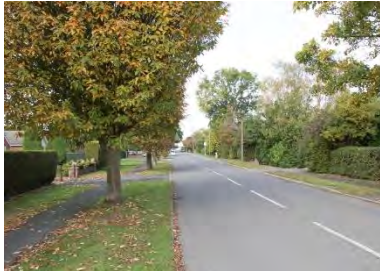
Figure 1: Tetney Lane

Hedgerows and street trees create valuable wildlife corridors enabling species migration as well providing significant aesthetic value. They also feature strongly throughout the village such as the tree lined Louth Road and Tetney Lane (Figure 1) as well as the hedgerows delineating the fields surrounding the village.