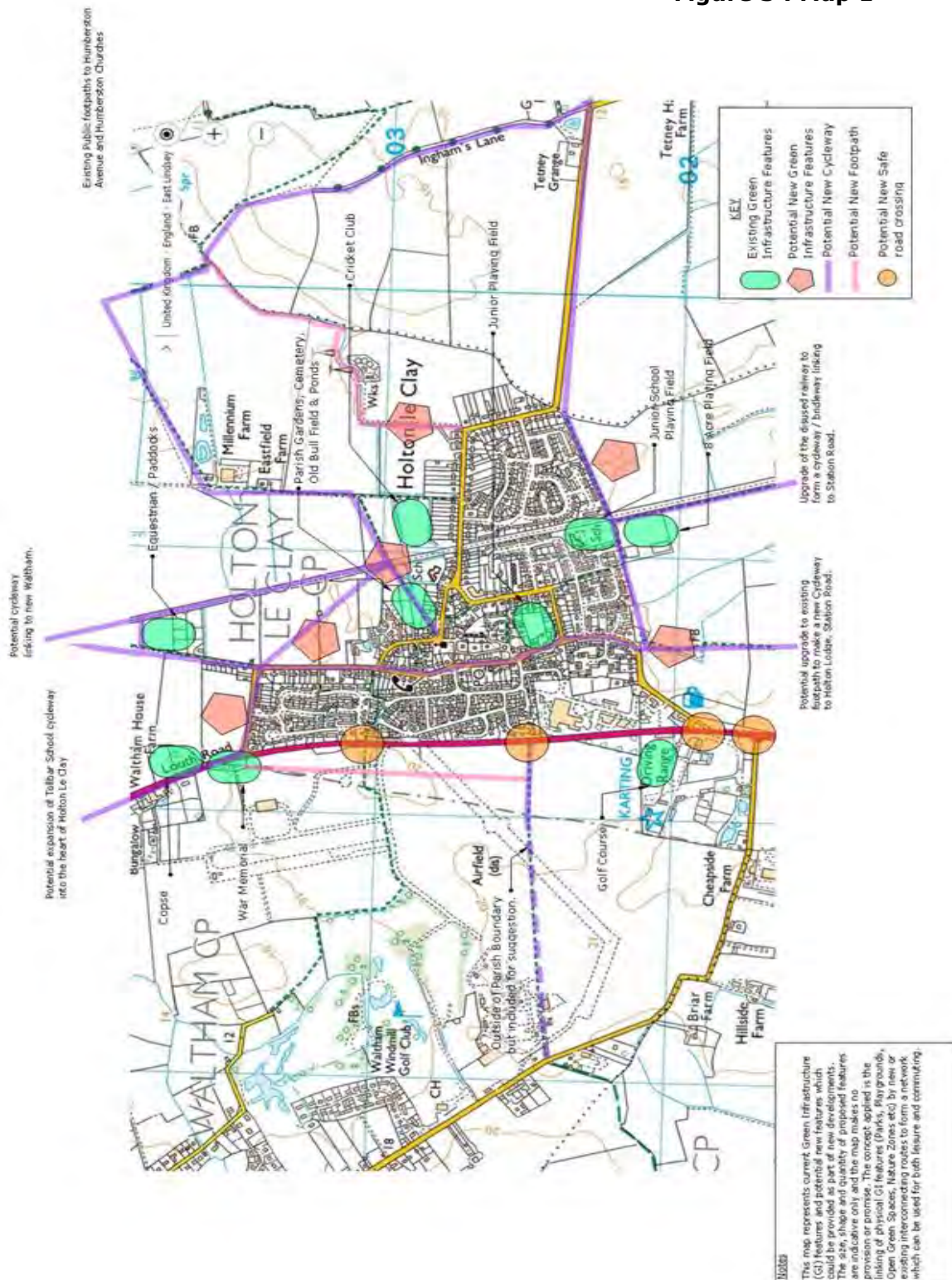
Figure 3 : Map 1