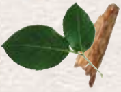
Leaves and bark