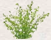
Hedge trimmings /cuttings

Take additional waste to your nearest Household Waste Recycling Centre (HWRC)