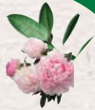
Flowers & plants, soil removed