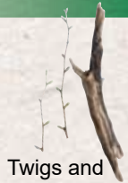
Twigs and branches