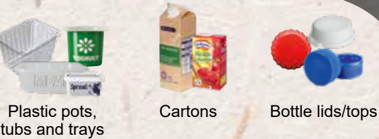
Plastic pots, tubs and trays Cartons Bottle lids/tops