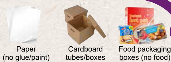
Paper (no glue/paint) Cardboard tubes/boxes Food packaging boxes (no food)