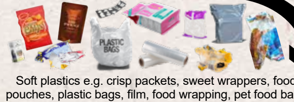
Soft plastics e.g. crisp packets, sweet wrappers, food pouches, plastic bags, film, food wrapping, pet food bags