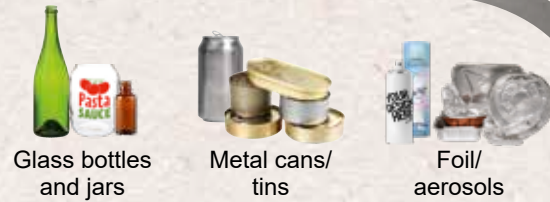
Glass bottles and jars Metal cans/tins Foil/aerosols