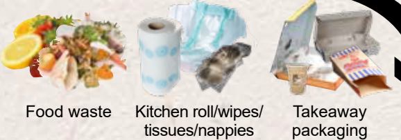
Food waste Kitchen roll/wipes/tissues/nappies Takeaway packaging