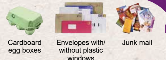
Cardboard egg boxes Envelopes with/without plastic windows Junk mail