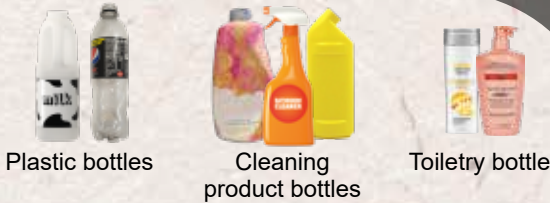
Plastic bottles Cleaning product bottles Toiletry bottles