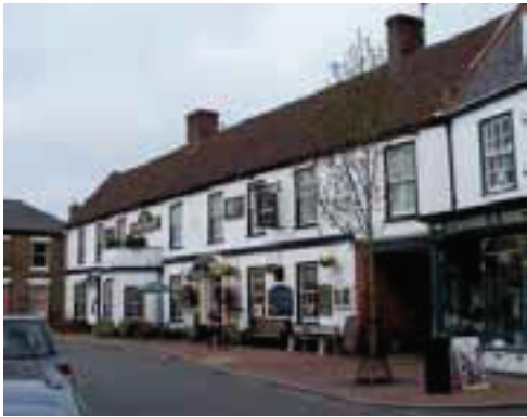
The White Hart PH