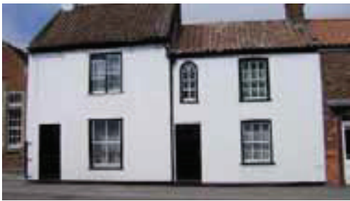
Stucco used at Nos. 8-10 Church Street