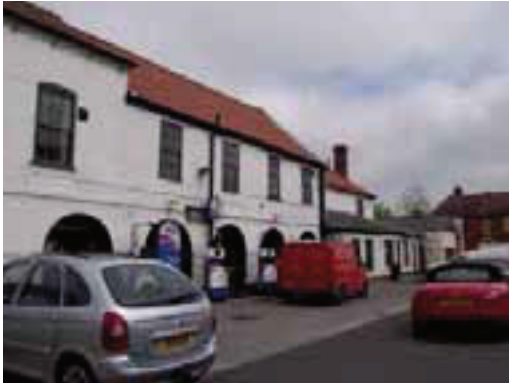
Former Market Hall in use as a garage