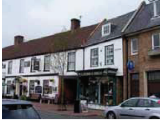
Decorative shop front at No. 1 High Street