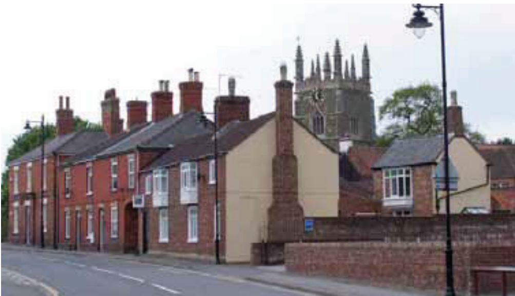
View of St. James's Church from Ashby Road