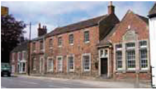
King Edward VI Grammar School