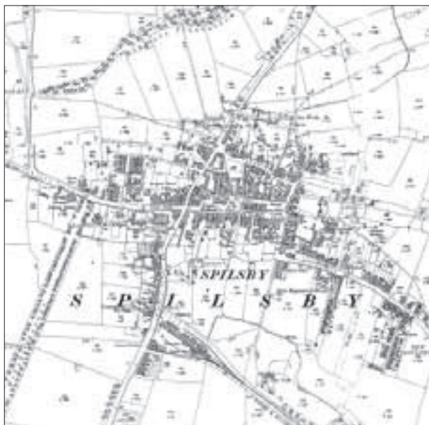
Extract from 1906 OS Map