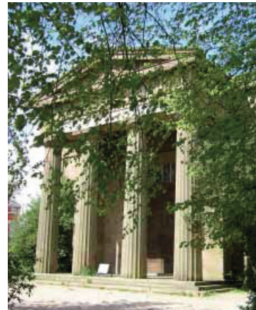
Former Court House, now Spilsby Theatre on Church Street

sense of bareness, a break in the street's continuity that emphasises the stark inappropriateness of this building's frontage. Church Street has a mixture of public or ex-public buildings (Parish Church, Catholic Church, theatre, old Grammar school) which provide a link between the retail area of the market and the residential areas to the north and south of Church Street.