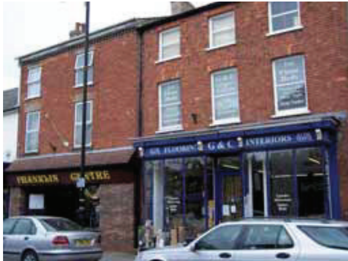
Traditional shop front (right) and inappropriate modern shopfront (left)