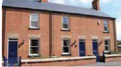
New development on Spence Street