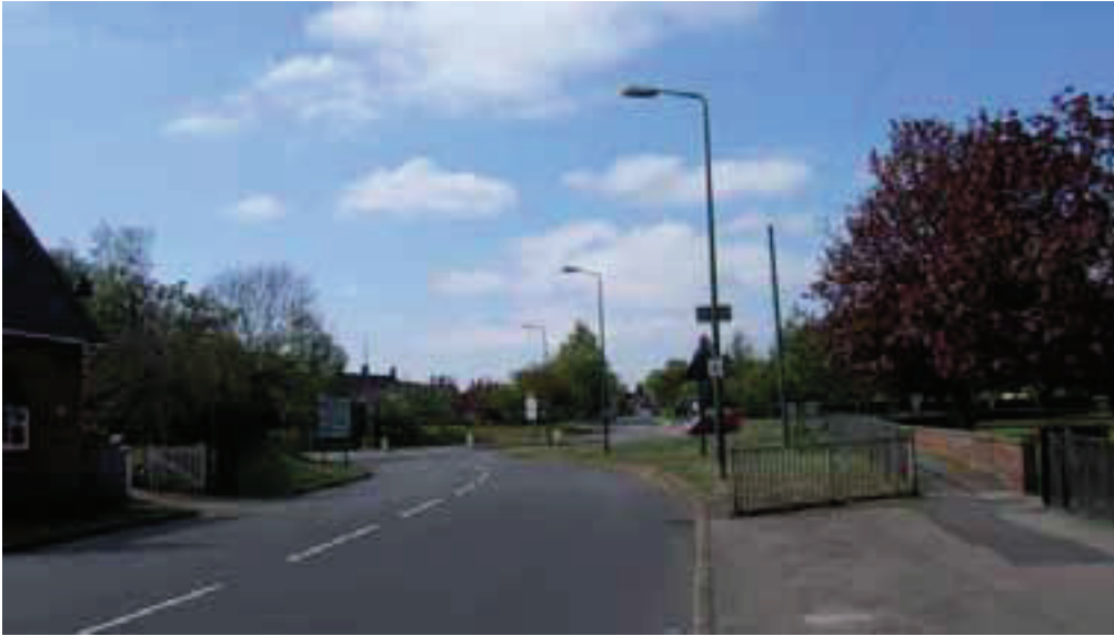
Church Street looking west