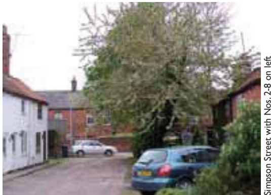
Simpson Street with Nos. 2-8 on left