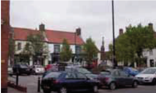
Market Place and Butter Cross