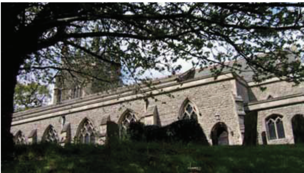
St James's Church