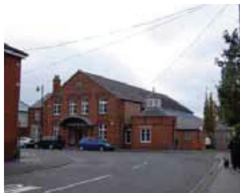
Franklin Hall, Halton Road

is Welham Gardens, formerly a Methodist Chapel. No.1 is in the conservation area while no.3 the other half of the Chapel building, is not, nor is No.2 the building behind along with various outbuildings. Also excluded are the gardens to the east of the building which look out onto open fields. These properties and gardens should be included within the conservation area.