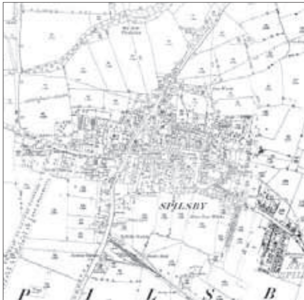
Extract from 1889 OS Map