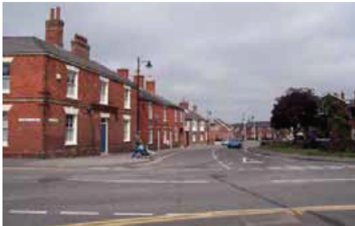
Ashby Road from Church Street

659 Market Street continues along the southern side of the market place where The Terrace ends and runs west-east to the top of Halton Road. It then dog legs to the north to form the eastern side of the market area rectangle, connecting Halton Road with Queen Street. Market Street is considerably narrower than The Terrace and has the feel of a busy town street. The buildings are not homogenous, but form an interesting mixture of styles and heights, in retail use with two public houses