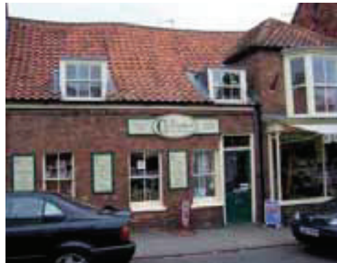
Nos. 39 High Street

7.45 Civic buildings include three churches, all of very different types; the Catholic Church is of red brick, St James' Church is of C14 origin, and the Methodist Church is in the high Victorian style. A surprising building for the town is the Courthouse of 1826 now a theatre, with its Doric Portico. The Drill Hall is now used as a public venue. The Market Place has the fine but dilapidated former Market Hall of 1764, now in inappropriate use as a garage.