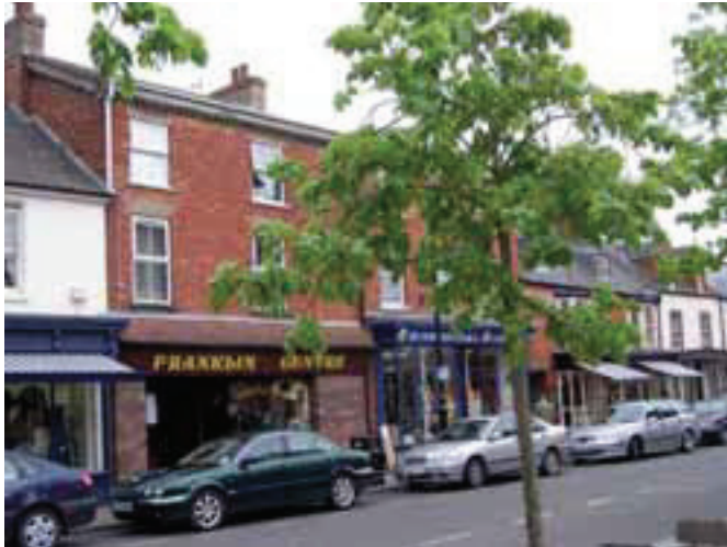
Franklin Centre, High Street