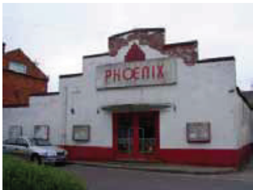
The cinema on Reynard Street