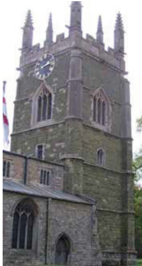
Green stone or Spilsby sandstone in use on St. James's Church Tower