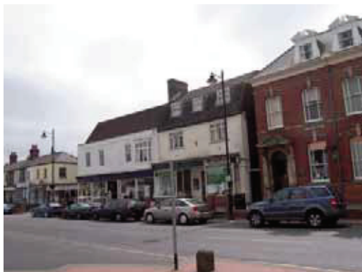
Nos. 4-7 The Terrace