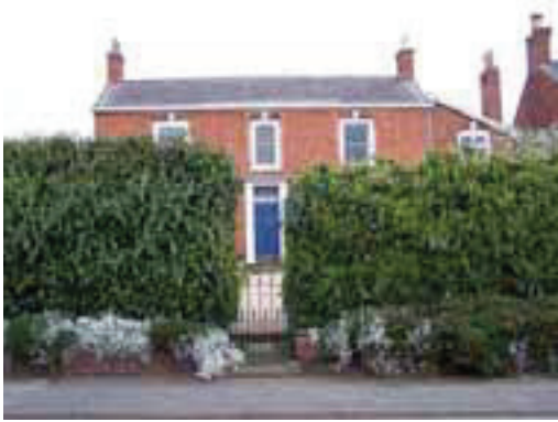
No. 31 Halton Road