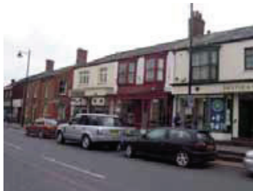
Houses and shops in The Terrace

the Parish Church and the Methodist Church are in prominent locations. The dramatic and notable Court House is now a theatre, and the C18 former Grammar School is in private ownership whilst the former Drill Hall on Halton Road has become a community hall. There are also several garages unusually located right in the centre of the town. There is very little industry within the conservation area, and little or no evidence of earlier industries, such as tanning, that were significant in the town. The central area contains few residential buildings; these are mainly concentrated around the edges of the conservation area.