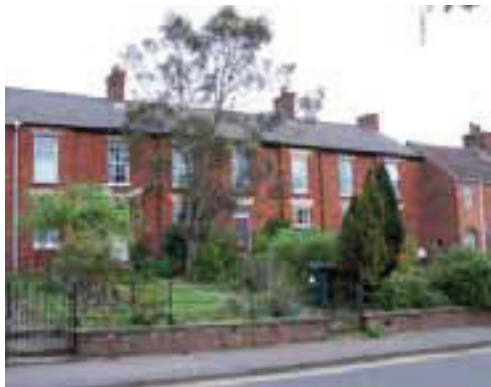
Nos. 35-39 Halton Road