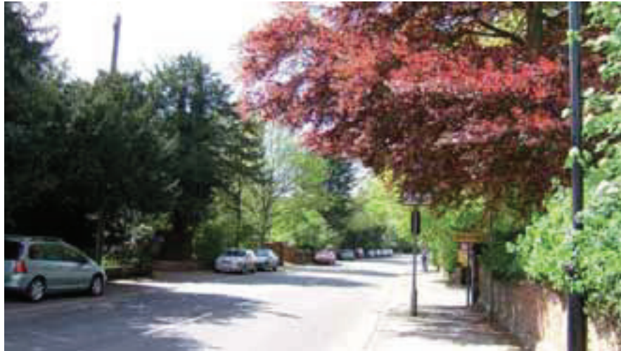
Tree-lined Church Street