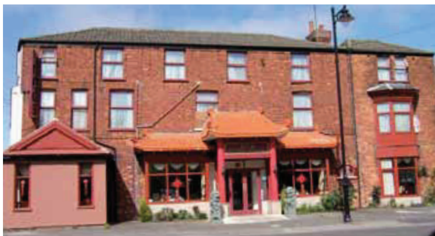
Beijing Dragon (former Shades Hotel) - subject of successful enforcement notice