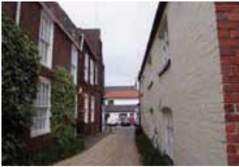
View of old Market Hall between Nos. 7&8 The Terrace