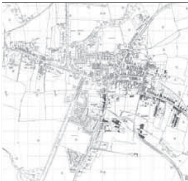
Extract from 1971-72 OS Map