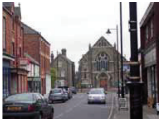
Market Street and Methodist Church

place, separated by the central open space of the market. The westernmost block contains C18 and C19 retail premises, the central section being of three storeys in brick, flanked on either side by two storey sections painted white. The buildings are built tight up against the back of the street, and indeed overflow onto the pavement in some cases. Nos. 22 and 20 High Street are possibly late medieval and have a good frontage which would benefit from repair. No. 1 Market Street which forms part of the same block of buildings is also in a poor state of repair with its brown painted render peeling and its windows boarded up. This key building in the market place is desperately in need of improvement to enhance the hub of the town.