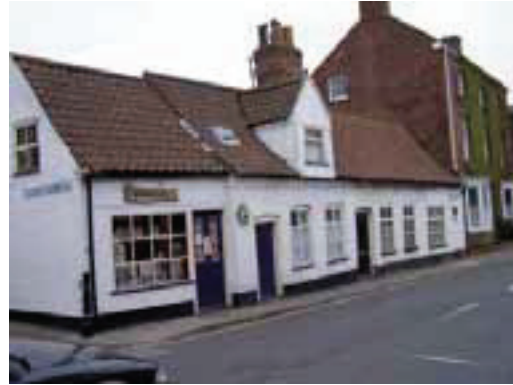
Nos. 2-4 Queen Street