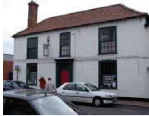
Wilson's, adjoining the old Market Hall

reveals, a fluted plastered doorcase with roundels, a triglyph frieze and a narrow hood.