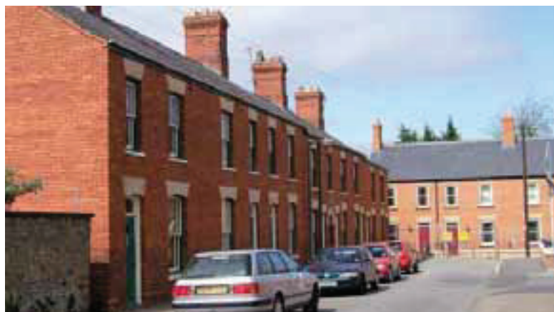
Spence Street and Poole's Lane

with a war memorial at the north-west corner. It is largely of Victorian appearance because of heavy rebuilding in 1879 but is actually late C14 and C16 with a tower of unusual greenstone. The south side continues with large buildings in large plots half hidden by trees, including the Vicarage, an elegant C18 house and the Catholic Church, a low, late Victorian building with a mini turret at the western end. After Eresby Avenue, Avenue House lies hidden by a brick wall and then the conservation area ends abruptly just after Avenue Cottage, just short of the junction with the A16. Avenue Cottage is a small estate-type cottage with attractive painted barge boards.