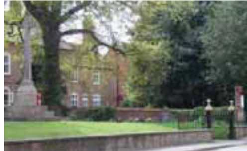
St James's Churchyard and war memorial