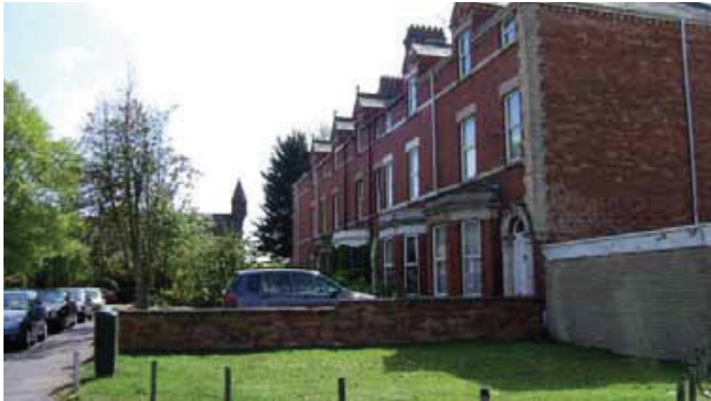
West End looking towards Church Street