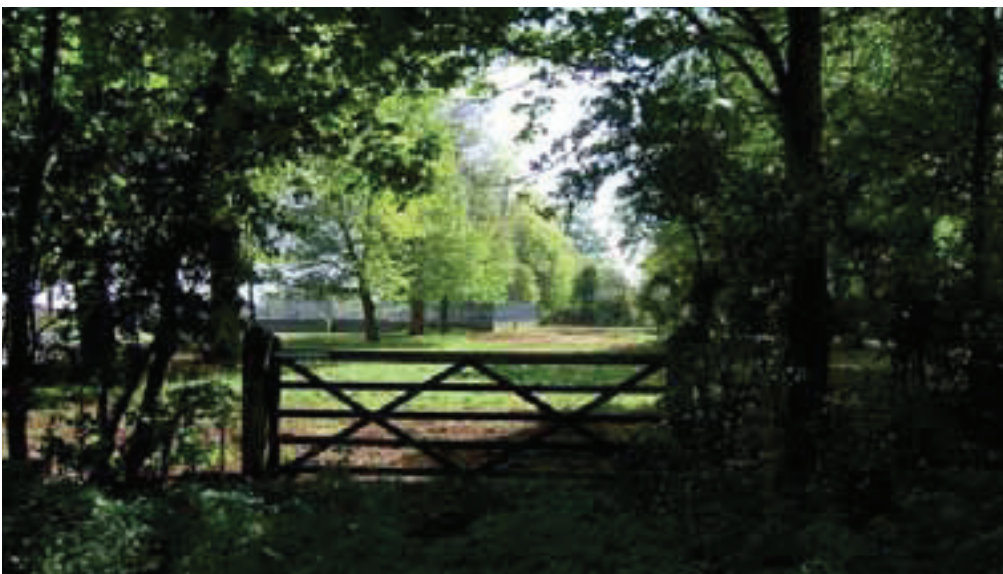
Eresby Avenue looking south