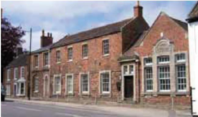
King Edward VI Grammar School, Church Street