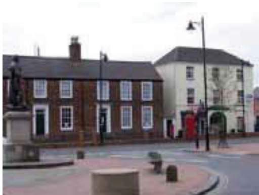
Nos. 2&3 The Terrace