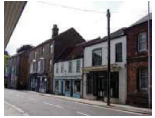
shop front, West Stree