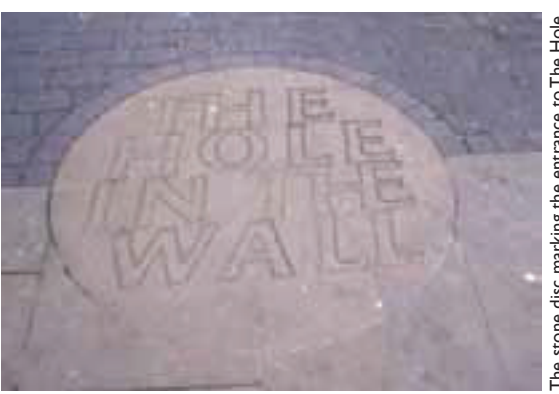
The stone disc marking the entrance to The Hole in the Wall, Market Place

two storey building is a landmark in the Market Place with central double half glazed doors with tall flanking glazed panels and rectangular pilasters with tiled inlays and a moulded surround with scrolled brackets flanked by tripartite sashes. The first floor has three semi-circular headed margin light sashes with shouldered stone architraves and keystones.