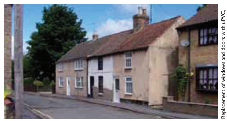
eplacement of windov Caroline Street