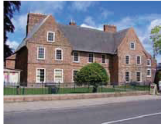
Alford Manor House, West Street