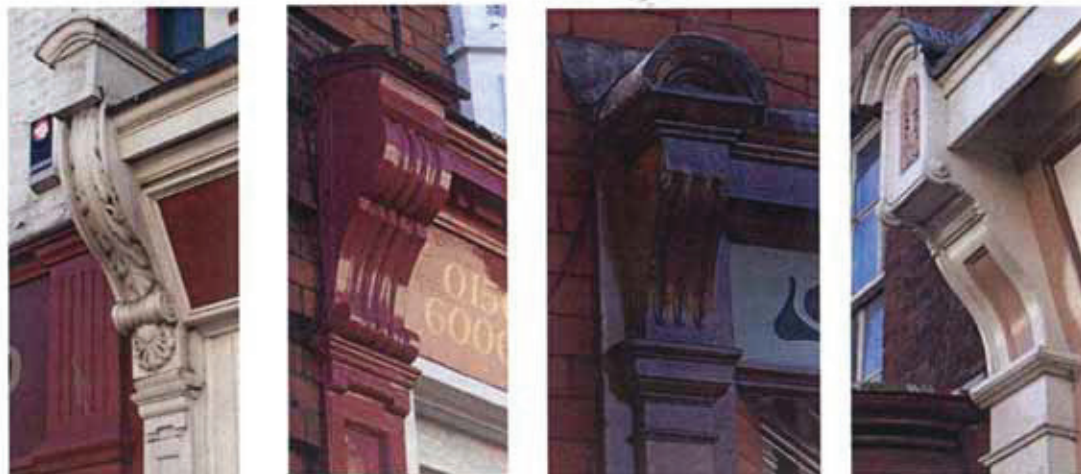
Console Brackets are often very decorative

"The shopkeeper prides himself on the neatness of his shop front, his little portico, and the pilasters and cornices are imitations of Lydian, Serpentine, Porphyry and Verde Antico antique marbles."