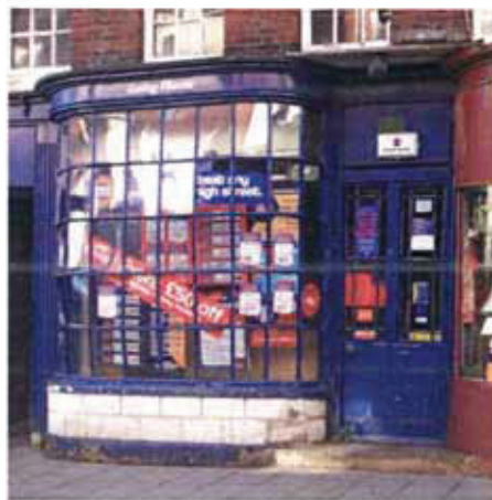
A fine bow window survives to this day at 20 Mercer Row