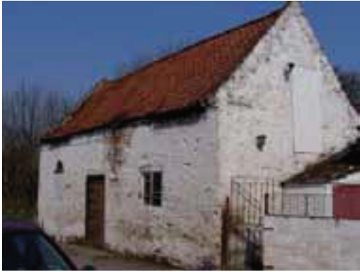
Rear of The Angel PH, High Street