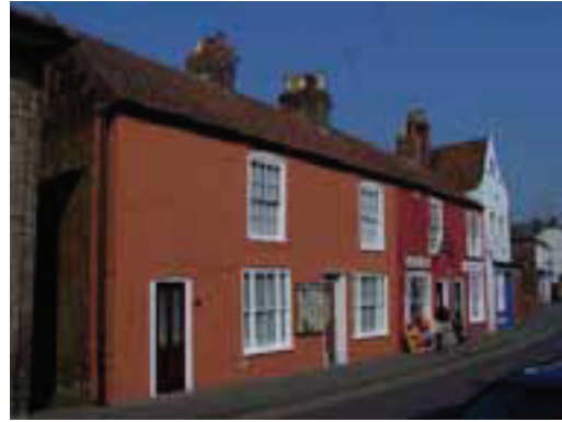
Nos. 23-25 High Street

6.9.2 Although the other buildings in this stretch are all two storeys, they are not without interest. No. 2, unusually for the town, is of gault brick though alterations (including the raising of the eaves) have been carried out in red brick. No. 5 dates from the late C18. It has multi-paned sash windows, those at the ground floor with side lights and a tall south end stack to cope with the height of the adjoining building. A plank door gives separate access to the rear. No. 8, although a simple C19 building, has a very attractive contemporary shopfront with dentil cornice and console brackets.