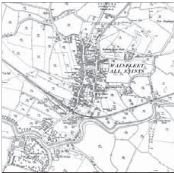
Extract from 1905 OS Map