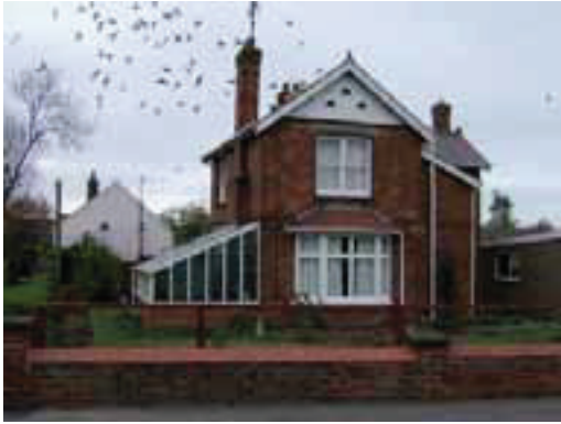
No. 11 Spilsby Road