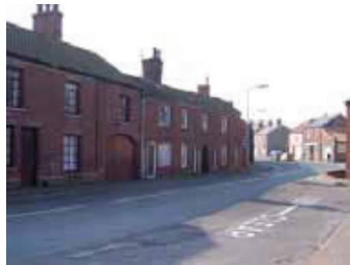
Nos. 2-8 Spilsby Road

7.3.2. Brewing remains an obvious local trade with the historic Bateman's Brewery dominating the south end of the town. Other former brewery buildings survive behind the High Street, with a former maltings off the south end of the High Street. Beside the railway line is a group of modern warehouse buildings which are the premises of probably the largest employer in Wainfleet after Bateman's Brewery, Mark Eldin Joinery.