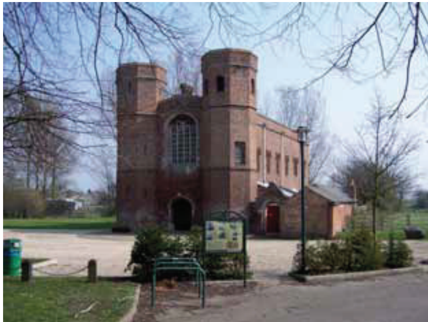
Magdalen College, St John Street