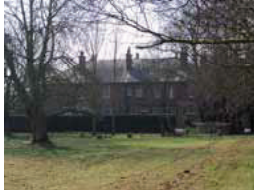
Wainfleet Hall, Vicarage Lane

pantiled rear wing of No.9 Station Road defines the south side of the road. Both buildings are right on the edge of the lane with no footpath.