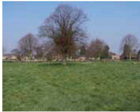
View to cemetery

6.1.5 The rest of the south side of Skegness Road, which is outside the conservation area comprises mostly 1960s former Local Authority housing and later, large, mostly detached bungalows. Particularly between the latter, views across the flat land towards the bypass are possible. There are some good road side trees, particularly outside the 1960s housing which form an attractive avenue with those in the parkland to the north.