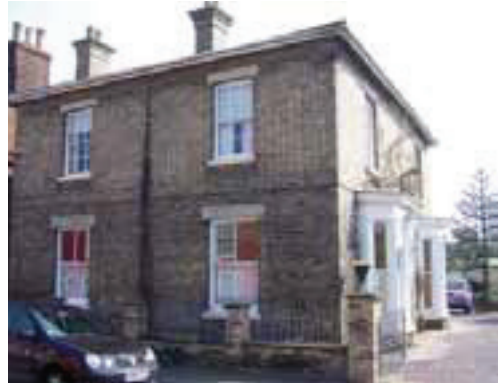
Beech House, High Street

7.5.3. The majority of the older cottages are of two or three bays, though often the terraced forms produce longer frontages. Only the grandest houses individually exceed three bays – the long frontage of Salem House being the most obvious example.