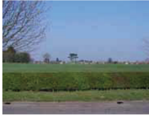
Green Hill from Skegness Road