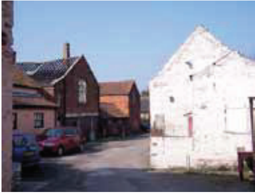
Rear of The Angel PH, High Street