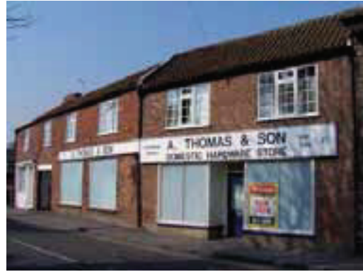
Nos. 20&21 High Street