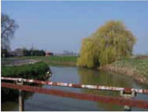
View west from Salem Bridge