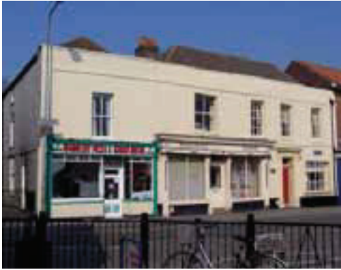
Good example of traditional shopfront (centre) with elements of another good traditional shopfront surviving on left.