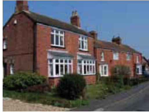
Nos. 7-11 Rumbold Lane