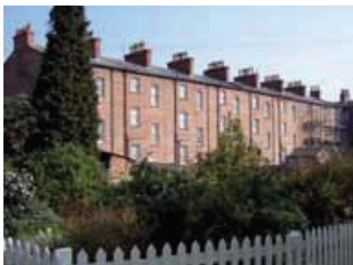
Rear of Barkham Street from High Street