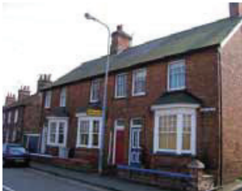
Lilley Villas, Skegness Road