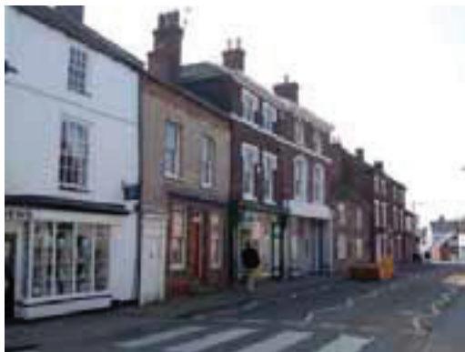
Nos. 1-7 High Street