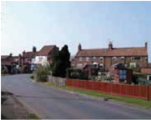
Northholme, view West