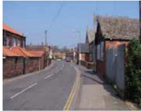
View north along St John Street

C19 house of three bays with a single storey lean-to at its west end. The one- and two-storey outbuildings attached to the north are a very good group visible from the street and identified as a smithy on all the Ordnance Survey maps since 1889.