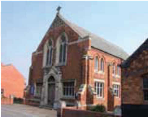
Methodist Church, St John Street