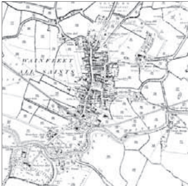
Extract from 1889 OS Map