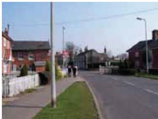
Railway Crossing, Station Road

6.9.7 The east side of the road is more domestic in character though it has as its centrepiece a three storey range with a large carriage arch and tumbled brickwork to the eaves. This property is being restored.