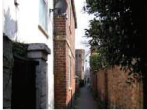
View east along Carr Lane

from the main streets in the town. This contrast is heightened by the presence of outbuildings and small scale storage and former agricultural / industrial uses close to the principal public and commercial buildings in the town.