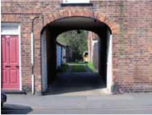
Carriage arch, No.48 High Street