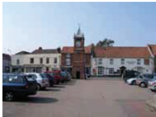
Clock Tower, Market Place

6.7.5 The presence of banks signals the location close to the Market Place. Although the former Barclays Bank, with its austere 1950s façade is now closed, the C19 Lloyds TSB bank opposite remains open. Whilst the ground floor of this is attractively detailed with a corner entrance right onto the Market Place, there is a poor quality first floor extension which is disappointing on such a prominent corner.