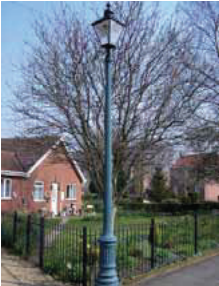
Streetlight, Silver Street