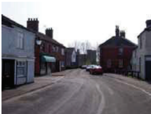
St John Street