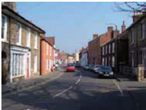
View north along High Street