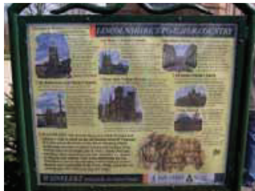
Notice board outside Magdalen College, St John Street

agents and property specialists is that a sympathetically restored period house can command 5-15% above the market price.