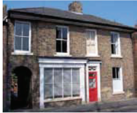
Successfully retained traditional shopfront in residential conversion