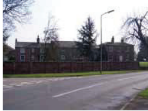
The Grange, Boston Road

around the Steeping River which has only a small clump of willows on its south bank, in contrast to the parkland of Wainfleet Hall opposite which has mature trees along its boundary and within the parkland.