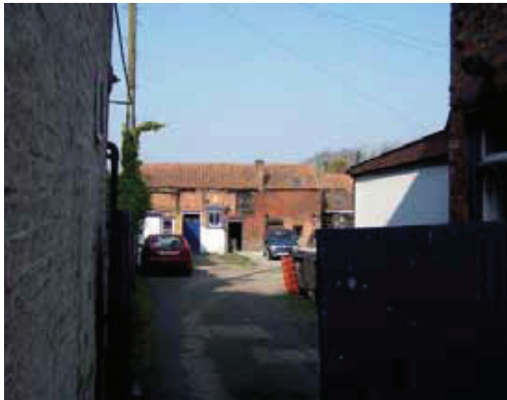
Rear of No.29 High Street