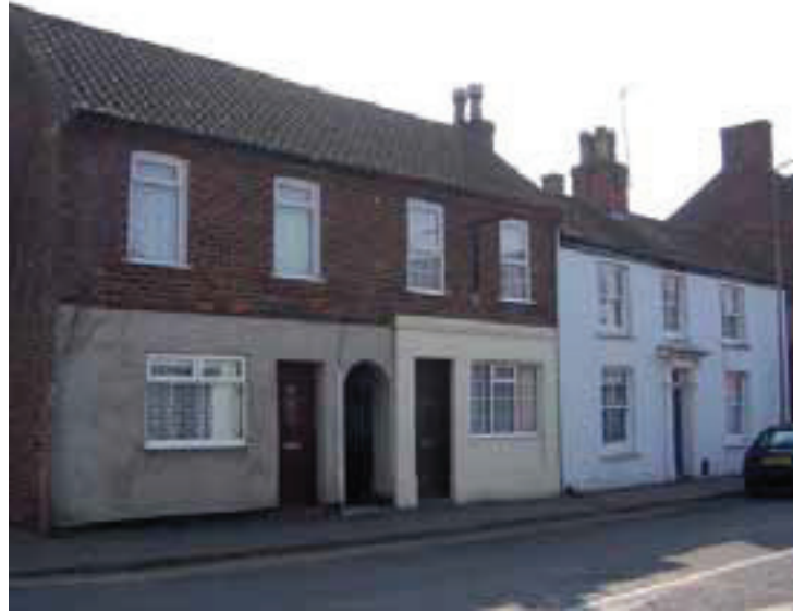
Impact of replacement plastic windows and loss of original slate/pantile roofs