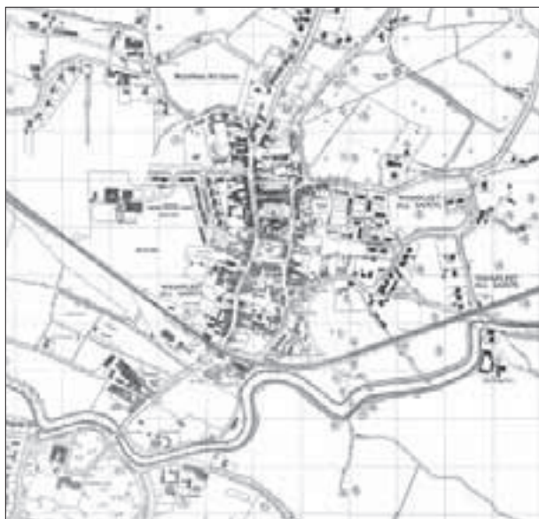
Extract from 1970 OS Map