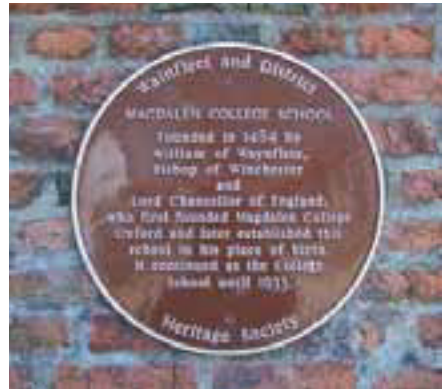
Magdalen College plaque, St John Street

7.8.4. The frontage of the Magdalen College School includes stone setts and flags with a number of planter beds and new trees to complement the impressive mature trees on the edge of St John Street. Vehicles are prevented from over-running by simple timber bollards and the lights are modern lantern styles. Nearby, on Silver Street, Carr Lane and St John Street are Victorian style lanterns which were part of the CAP Scheme.