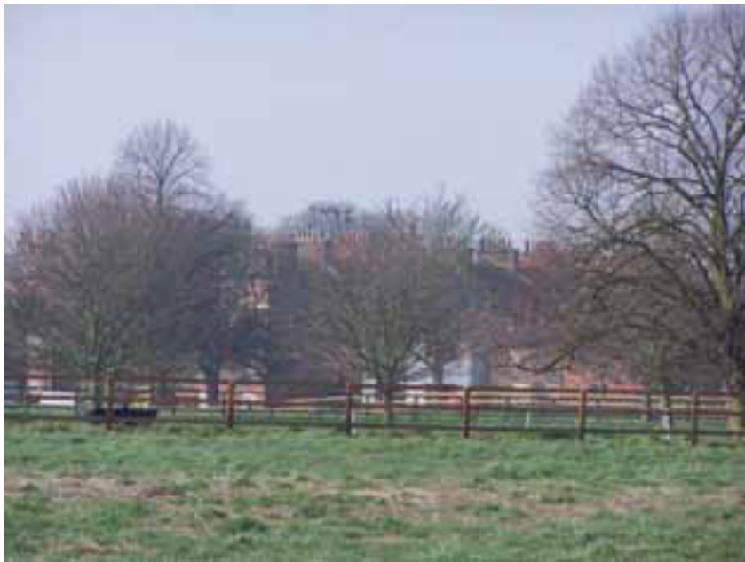
View to Barkham Street