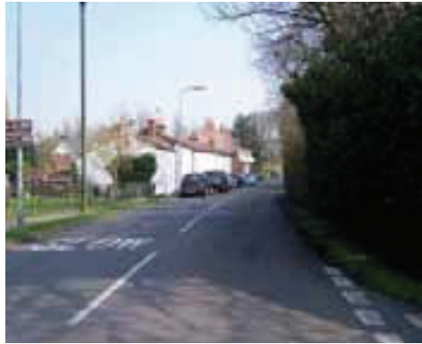
View north along Station Road