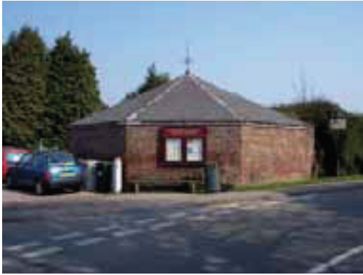
Pinfold, Vicarage Lane