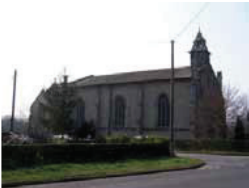
All Saints' Church, Station Road