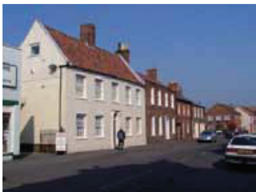
Nos. 51-56 High Street