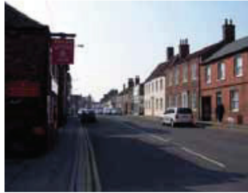
View south along High Street

7.4.4. A number of public buildings survive in their original uses. These include the Anglican and Methodist Churches, the parish and OAPs hall; the latter is a simple timber structure. The former police station on Rumbold Lane is now residential though the railway signal box remains in its original use.