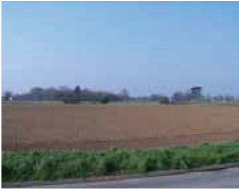
View from Skegness Road