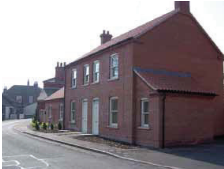
New housing, Brewster Lane