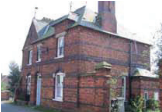
Police House, Rumbold Lane