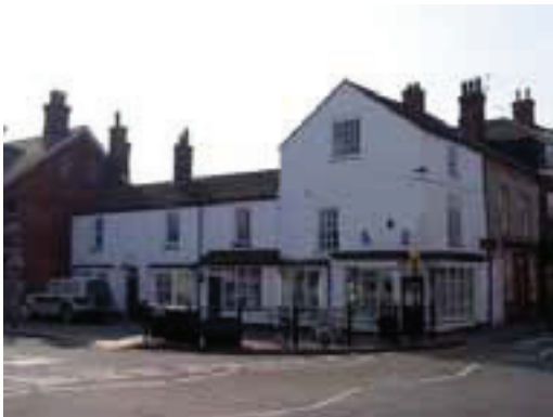
No.1 Market Place & No.1 High Street