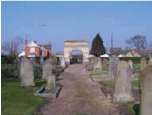
Cemetery with War Memorial Arch