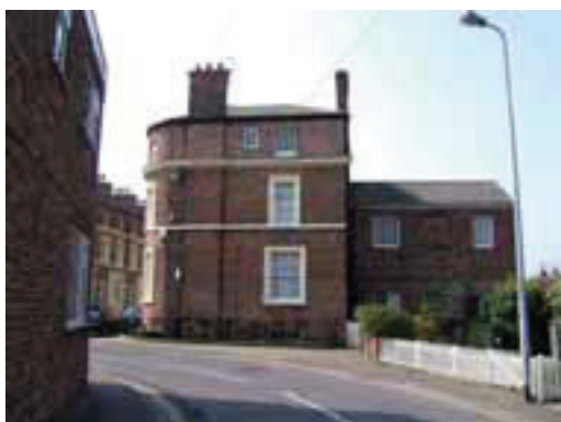
No. 14 Barkham Street from St John Street