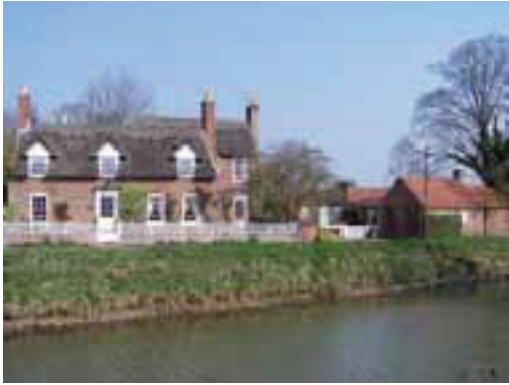
Bridge House, Haven Side