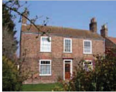
No. 2 The Walk

Pleasant. Although it is well-enclosed, it is more open than Carr Lane as the buildings on the north side of the lane are set back behind relatively deep gardens, although these are bordered by hedges which maintain the tight definition of the path. Of these buildings, No.2 is the most interesting and least altered with 6/6 sashes surviving at first floor. The south side of the lane is tightly defined by boundary walls at the east and west ends; the central section is currently under development with infill housing. Views into The Walk are good, framed by the various boundaries and structures that line it; views west along The Walk are towards the parkland surrounding Northolme Hall.