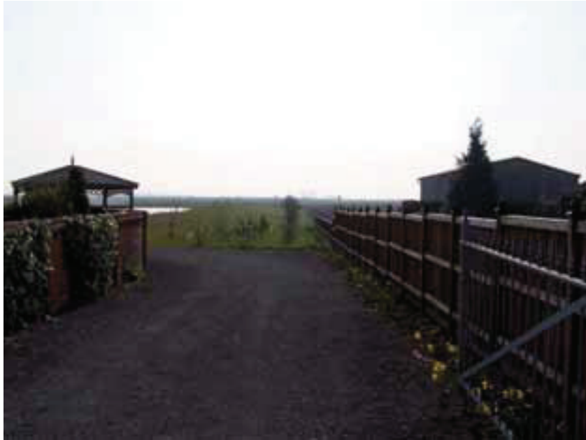
View to A52 from Skegness Road