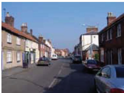
View north along High Street

several exceptions to this rule however. Nos. 51 High Street dates from the late C18 and is of lined and painted render with a bracketed doorway in the middle of its imposing 5-bay façade. All the windows are 8/8 sashes and the symmetry of the building is emphasised by the big central ridge stack. No. 52 adjoins to the north and is higher to the eaves than its neighbour but has a very shallow pitched roof. It dates from the early C19, has four bays with the doorway in bay 3 and 6/6 sash windows. Nos. 53-5 to the north complete what is a good grouping of buildings. Although these buildings are later C19 they exhibit two key characteristics of buildings in this part of the town – a carriage arch and good surviving C19 shopfronts. The paired shopfront to Nos. 54/5 is an attractive survival with box sash windows at first floor level.