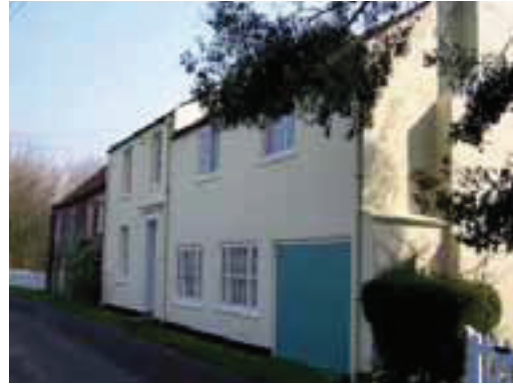
No.4 Haven Side

Two good mature trees stand on the wide verge to the north of the U-shaped stable and outbuilding range with more mature trees opposite on the river bank.