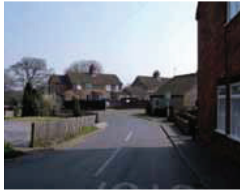
Northholme, view East

C19 builds. Nos. 12-18 turn their backs to the road, No. 10 on the corner is taller and with corbelled eaves, No.8 has a carriage arch whilst the lower block of three (Nos. 2-6) have an arched snicket in the middle of the elevation. The houses have a variety of mostly modern windows though the chimney stacks give the buildings a strong silhouette.