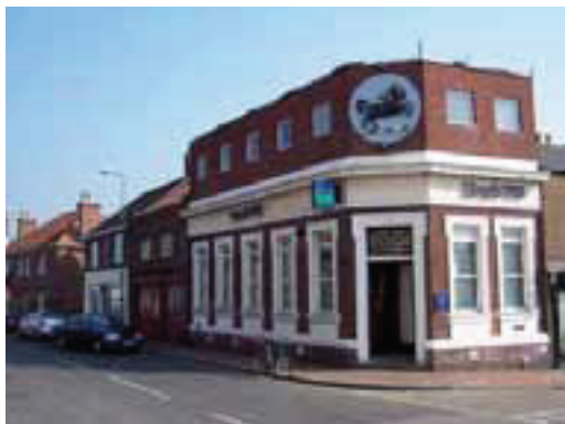
Nos. 77-79 High Street