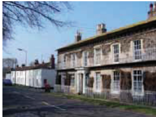
Salem House & Nos. 1-9 Station Road

added with the wide porch at the west end in 1932. This has an Eastern European feel with its scaly leaded roof.