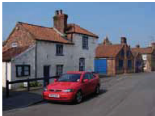
Jolly Sailors PH, St John Street

6.17.2 The College School is a remarkable C15 building, now a library and museum, but built by William Waynflete, the Bishop of Winchester to provide scholars for his then recently-founded Oxford College. The building is of red brick with vitrified brick diaper-work and ashlar dressings. The shallow pitched lead roof is not visible and the façade is dominated by a pair of turrets – that to the north houses the staircase, that to the south, the bells. Within the gable end facing the street is a large restored window with Perpendicular limestone tracery and a plank door beneath.