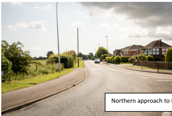
Northern approach to Holton-le-Clay – Louth Rd

The older properties in the village are mainly distributed along these three routes. The rural aspects at each entrance to the village are highly valued by residents and the East Lindsey Local Plan (1995 amended 1999 and 2007) states that 'Development in Holton-le-Clay is considered to have reached the limits of natural growth and further development would expand unnecessarily into the open countryside'.