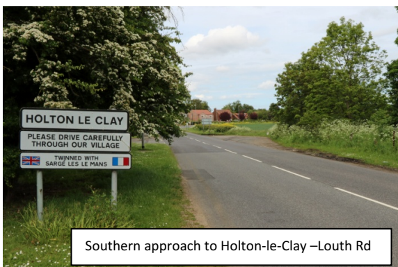
Southern approach to Holton-le-Clay –Louth Rd