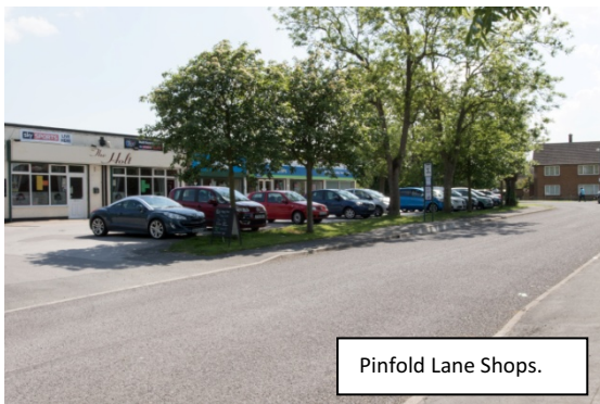
Pinfold Lane Shops.

Opposite the junction with Pinfold Lane are the Infant School, the Police Station, the old wooden Church Hall which is now a photographic studio, and a breakfast and after-school club. Each has a limited amount of off-road parking but the area is congested at the beginning and end of the school day.