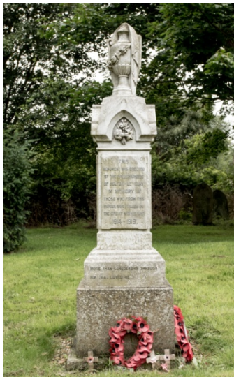
The War Memorial in the churchyard of St. Peter's Church

The village has a Grade 2 listed brick and stone Anglican Church, St Peter's. It has a chancel, nave, and an embattled tower with 3 bells. The tower, chancel and nave arch are of Saxon or of very early Norman origin. Within the churchyard is a 14th-century cross base and shaft and a war memorial. The Church was partly restored in brick during the Nineteenth Century. Holton-le-Clay is also recorded as having a Wesleyan chapel in 1827 and Primitive Methodist in 1836.