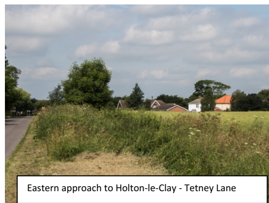
Eastern approach to Holton-le-Clay - Tetney Lane

Three developments are built behind the older properties on the main roads and these are not immediately apparent to travellers passing through the village on the main roads. To the west of the Louth Road there is an estate which includes Edinburgh Drive, Lindsey Drive and Holton Mount. To the east and south of Pinfold Lane is a development built around Picksley Crescent. The third estate is built around Langton Road to the south of Tetney Lane.